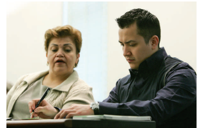
Parents attended new student Orientation at NYU Law School where SEO holds Saturday Academy classes.

time annually -- adding the equivalent of 48 school days to the 180-day public school calendar -- devoted to critical reading, critical writing, vocabulary, grammar and mathematics.