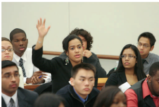
SEO freshman and sophomore College Scholars attended the Winter Retreat

Ninety-six freshman and sophomore College Scholars, many enrolled at top-tier colleges, attended the SEO Winter Retreat at NYU Law School in January. Funded by Lehman Brothers, the retreat focused on developing academic skills, building relationships with college professors and administration, honing interviewing skills for summer internships and de-